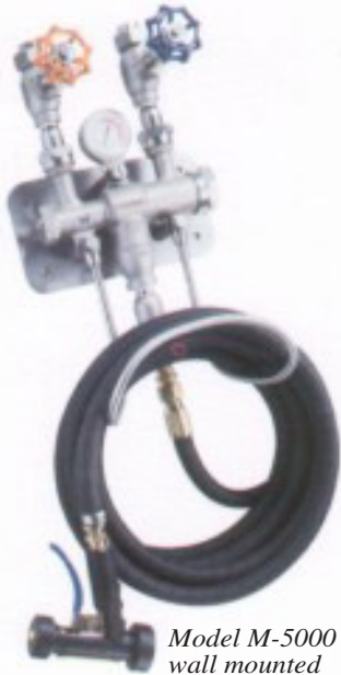
Model M-5000 wall mounted unit.

The M-5000 is available in bronze or in bronze chrome plated. Maximum recommended operating temperature: 200°F / 93.33°C Maximum working pressure: 150 PSI (10 BAR)