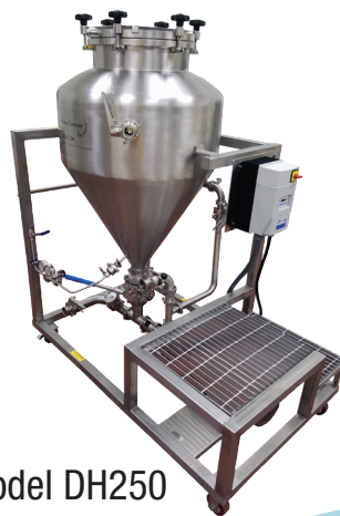
Model DH250 100,000 bbls/yr