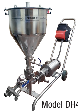
Model DH45 <5,000 bbls/yr

For more information, call 1-800-361-5361 or e-mail sales@ harco.on.ca.