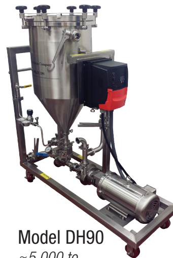
Model DH90 ≈5,000 to 100,000 bbls/yr