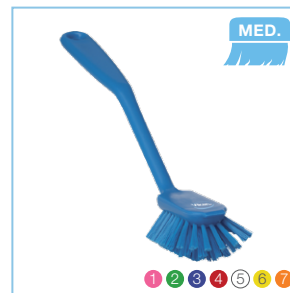
4237x Dish Brush with Scraper