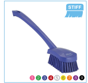
4186x Heavy-Duty Long-Handled Hand Brush