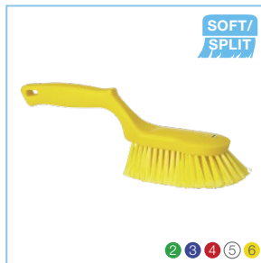
4167x Raised-Handle Washing Brush