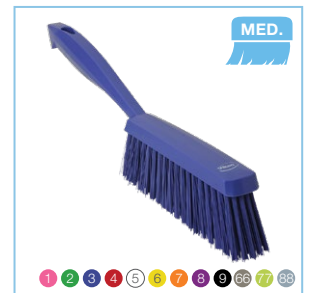
4589x Large-Particle Bench Brush