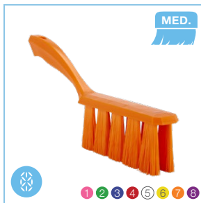
4585x UST Medium Bench Brush