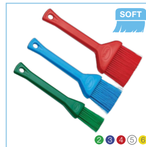
555230x, 555250x, 555270x Pastry Brushes