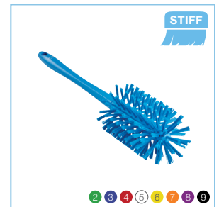
5381-90-x Bottle Brush