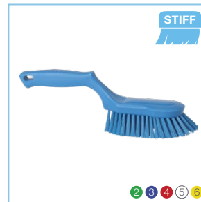
4169x Raised-Handle Scrubbing Brush