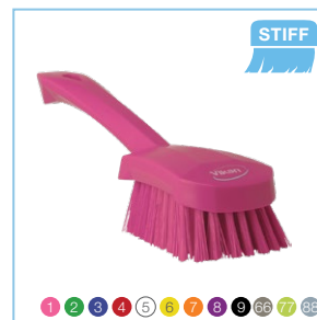
4192x Short-Handled Scrubbing Brush