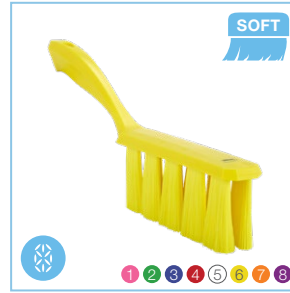
4581x UST Soft Bench Brush