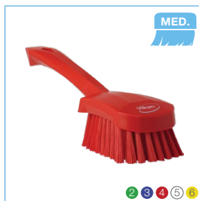
4190x Short-Handled Brush