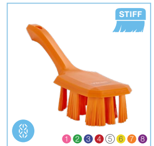
4179x UST Short-Handled Hand Brush