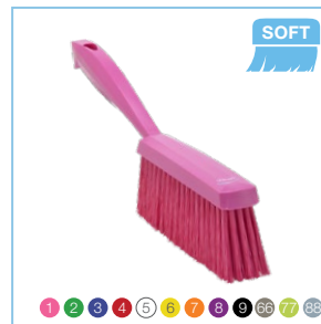
4587x Fine-Particle Bench Brush