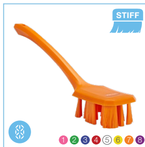
4196x UST Long-Handled Hand Brush