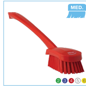
4182x Long-Handled Scrubbing Brush