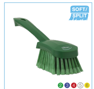
4194x Short-Handled Washing Brush