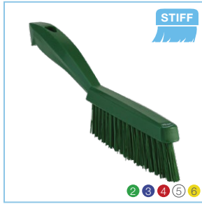
4195x Narrow Hand Brush