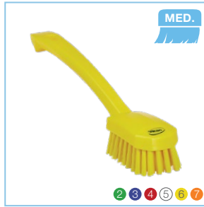
3088x Utility Brush