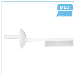
41845 Brush with Hand Guard