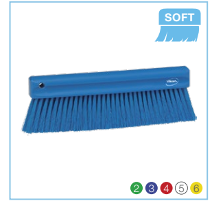
4582x Fine-Particle Counter Brush