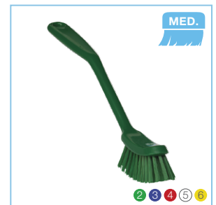
4287x Narrow Dish Brush