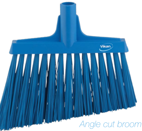
Angle cut broom