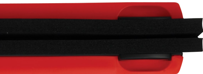
Double Blade Foam Squeegee