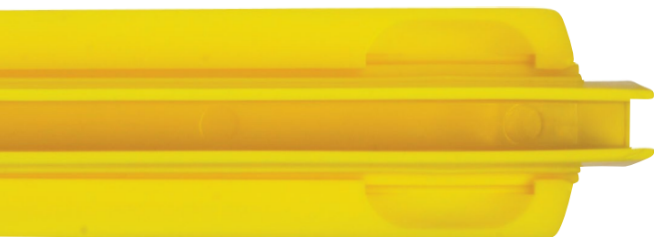
Double Blade Ultra Hygiene Squeegee