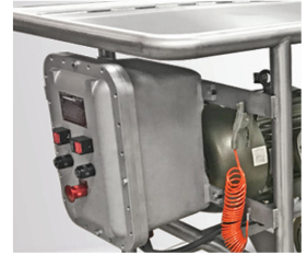
Explosion Proof VFD & Motors