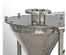
Bulk Bag Connector