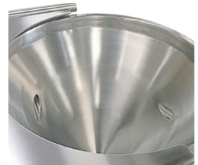
Whirl Pool Hopper