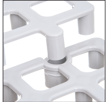
Easy Assembly – Modular grid pieces snap together to create any size of rack system