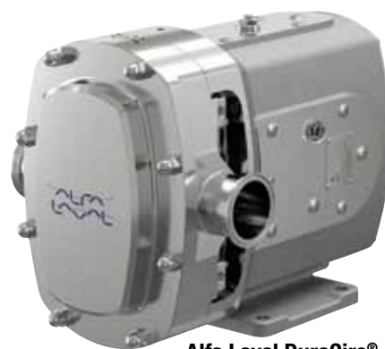
Alfa Laval DuraCirc®

Visit our web site at https://www.harcosupply.com/pumps/positive-displacement/alfa-laval-duracirc-pumps/