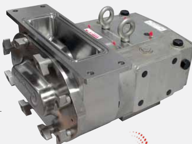
Ampco Pumps Company

Contact Harco for your Ampco ZP1/ZP2 pump or ZP1/ZP2 replacement part inquiries.