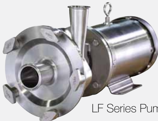
LF Series Pump

AMPCO LF - Ampco's LF is designed with a unique front-loading seal for easy maintenance and improved cleanability. Balanced impellers, a self-aligning shaft design and tight manufacturing tolerances, minimize vibration and improve seal life, making the LF a preferred choice for difficult-to-handle products.