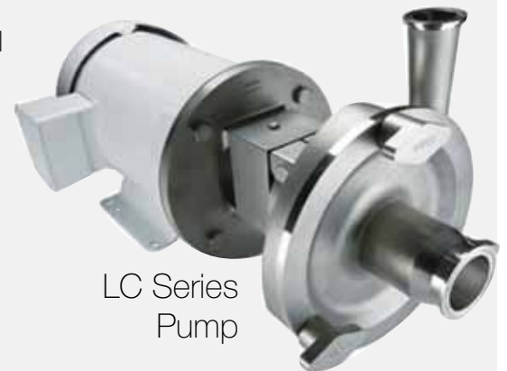
LC Series Pump

AMPCO LD - LD Series is a close-coupled version of the LC Series, using a double mechanical seal. The LD is used with abrasive or volatile products, and in vacuum applications.