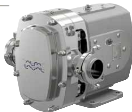
Alfa Laval DuraCirc® Aseptic