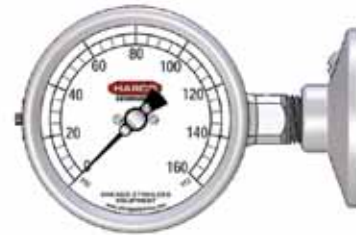
2-1/2" RIGHT SIDE MOUNT (Shown with 1-1/2" Tri-Clamp)