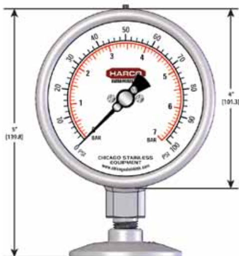
4" BOTTOM MOUNT (Shown with 2" Tri-Clamp)