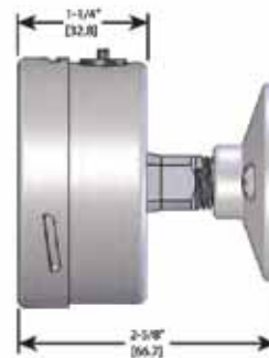
2-1/2" BACK MOUNT (Shown with 1-1/2" Tri-Clamp)