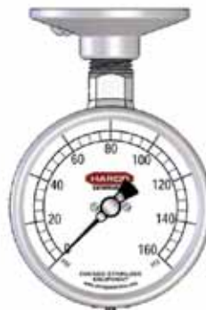
2-1/2" TOP MOUNT (Shown with 1-1/2" Tri-Clamp)