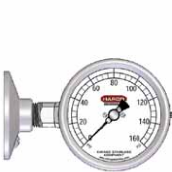
2-1/2" LEFT SIDE MOUNT (Shown with 1-1/2" Tri-Clamp)