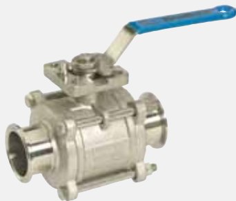
2-Way 3 Piece Encapsulated Ball Valves - BV2CV-200CC-A