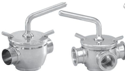
Cipriani Harrison 11 Series Plug Valves