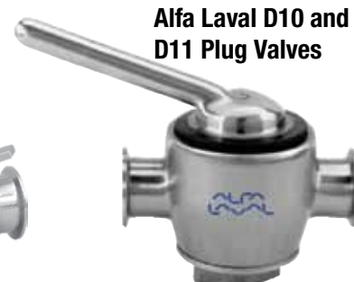
Alfa Laval D10 and D11 Plug Valves