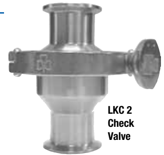
LKC 2 Check Valve

Specially designed for use in stainless steel pipe installations, Alfa Laval's LKC-2 non-return valve ensures the single directional product flow through process lines. This provides protection for process equipment that can be affected by reverse flow and prevents pressure surges and/or system shutdown. Widely used in various processes throughout the sanitary industry, these standard non-return valves are safe and highly reliable.