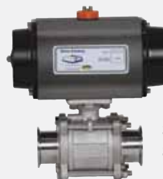
Pneumatically Actuated 3-Piece Sanitary Stainless Ball Valve - BV2CV-200CC-BBC

Visit our web site at https://www.harcosupply.com/valves/ball-valves/dixon-ball-valves/