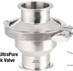
LKC UltraPure Check Valve

Designed to meet the specific demands and strict standards of the biotech, pharmaceutical and personal care industries, the LKC UltraPure non-return valve provides safe, easy installation and high, consistent quality.