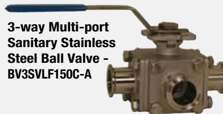
3-way Multi-port Sanitary Stainless Steel Ball Valve - BV3SVLF150C-A