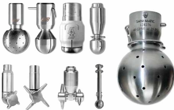
SPRAY DEVICES & SUPPLY TUBES