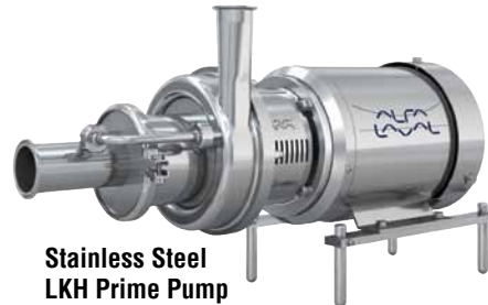
Stainless Steel LKH Prime Pump