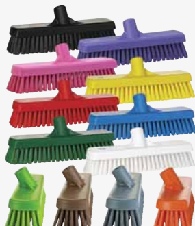
Deck-Wall Scrub Brushes