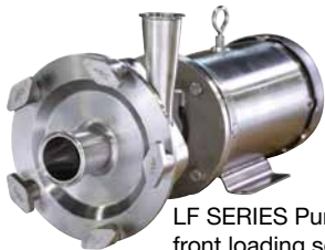
LF SERIES Pumps - front loading seal design.

LC/LD/LF Series Centrifugal Pumps high-efficiency design and performance offers gentle product handling capability. Fristam Replacement Pumps.