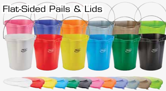
Flat-Sided Pails & Lids