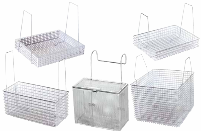
COP PARTS BASKETS

Harco distributes equipment and replacement parts for the following lines: