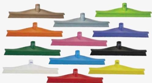
Ultra Hygiene Squeegees