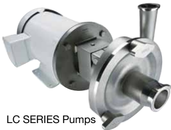
LC SERIES Pumps

Harco maintains a complete inventory of spare parts for all pumps. Save time and money with Ampco's spare centrifugal and PD parts. Harco's team is ready to assist with your next project.