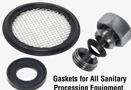
Gaskets for All Sanitary Processing Equipment.

All styles and sizes are maintained in stock to ensure you fast delivery of the highest quality gaskets at all times. Closures, Dust Covers, Filters, Strainers, Clamp and other styles are all available.